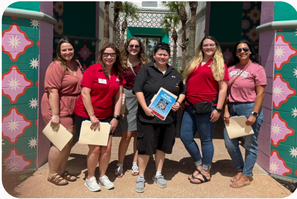
JLSC Members at Participating in a Brunch & Stroll at the Avenues Viera as part of Fund Development Training and Engagement